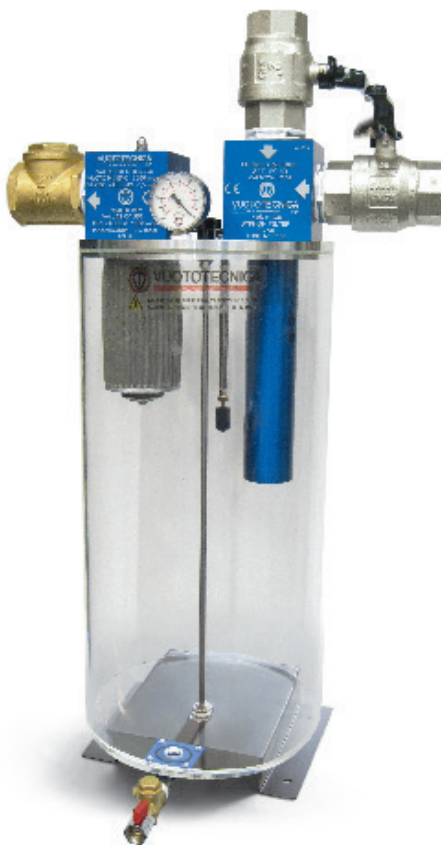
FS50T (spezielle Befestigungshalterung)